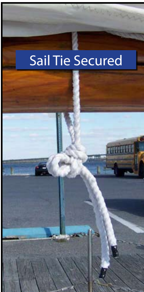
Sail Tie Secured

Step 3: Take the working ends and pull a loop through the loop made in Step 2, without pulling the ends all the way through.